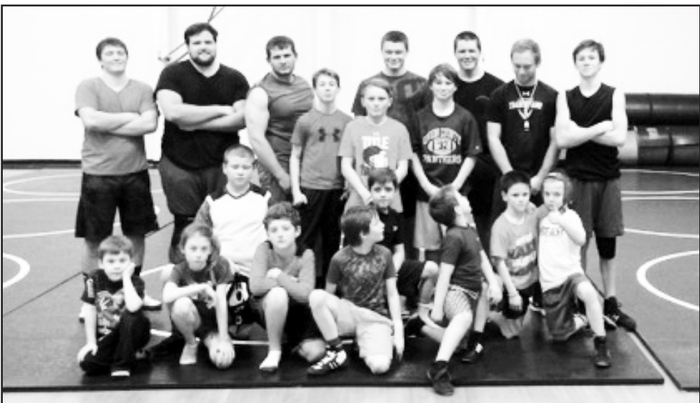
Blairsville USA Wrestling Team

USA Wrestling is a sports club open to male and female athletes between the ages of five and fifteen. USA cards cost $50 are purchased on the TEAM GEORGIA page and good for the whole year. USA cards and registering for tournaments are both handled on this website: www.teamgeorgiawrestling.com