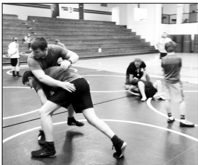
Blairsville USA Wrestling Team practice